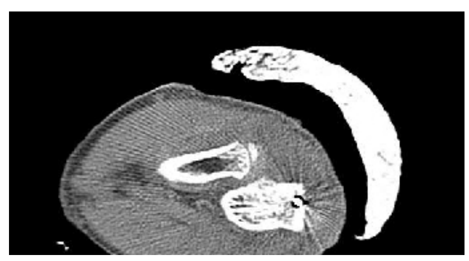
Figure 2. You can see an old fracture on proximal part of ulna, metallic fixation material, and streaking artefact on routine axial CT image (A). Fracture and displacement way is seen without any artefact on 3D VR image (B).

Spiral CT has two major roles in musculoskeletal trauma: These are to define or exclude a fracture that was equivocal at plain radiography and to determine the extension of fracture and thus provide guidance for therapy. Spiral CT will provide additional information about soft-tissue abnormalities and demonstrate osseous