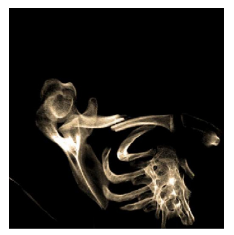
Figure 1 A-B. Axial CT image of the clavicula reveals a fracture (A). VR spiral CT image clearly shows a fracture and posterior dislocation (B).

the extension of fractures, bone fragment relations to joint and soft tissue changes, and to compare the axial and 3D VR images in detection of these conditions.