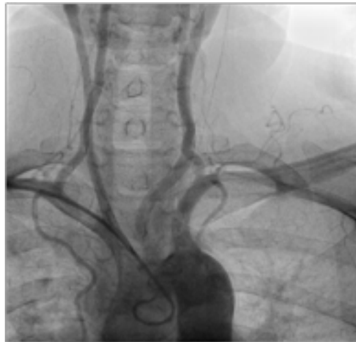
Figure 3. Totally occluded left subclavian artery

no subvalvular involvement. Aortic valve was morphologically normal. Aortogram through right radial route revealed that abdominal aorta was cut off distal to renal artery and there were collaterals to lower limb vessels. Left subclavian artery was totally occluded distal to vertebral artery. Nerve conduction velocities were severely reduced in lower limb. Computer tomography of spine was normal.