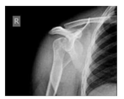
Figure 1. AP view of the shoulder reveals locked fracture dislocation of the glenohumeral joint.

anterior fracture-dislocation of GHJ that is traumatic without seizures or electrocution and treated with open reduction and internal fixation.