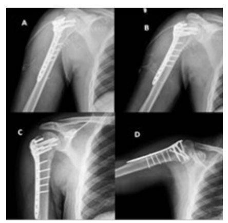
Figure 3. Immediate (A, B) and late (C, D) postoperative radiographs

associated fractures or articular surface defects. Figure 1 reveals the locked anterior dislocation of the glenohumeral joint and split of the humeral head. A CT-scan allowed quantification of the skeletal lesions and planning for the treatment (Figure 2).