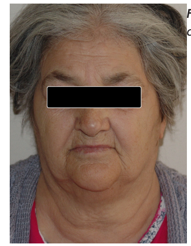
Figure 1. Sheehan's facial appearance

Pseudogout is known to be related to endocrine and metabolic diseases. These include hyperparathyroidism, hypothyroidism, Wilson's, hypophosphatasia, gout and rheumatoidoarthritis particularly. It is also reported to be