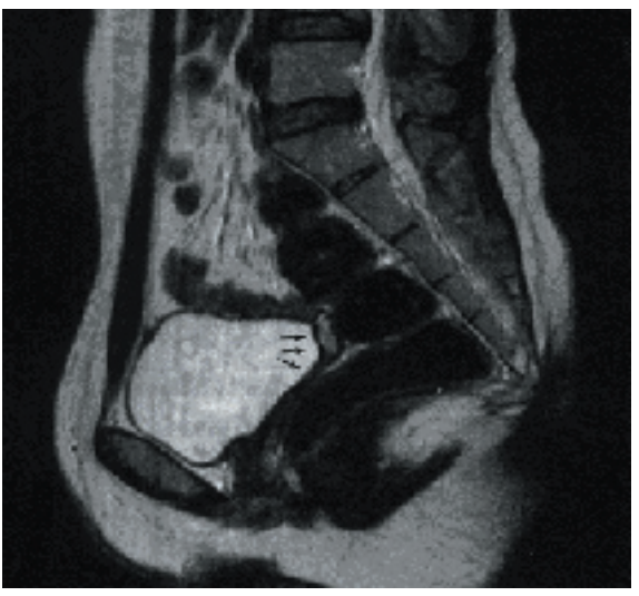
Figure 2. Sagittal TSET2-w image shows rudimente uterus and upper portion of the vagina as hypointens thin fibrous structure (arrows).

usually reach to the levels that suffice the ovulation in the patients with hypothyroidism. Myxedema is the clinical presentation of hypothyroidism. But some patients as in our case who appear clinically euthyroid display labaratory evidence of subclinical hypothyroidism (5).