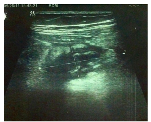
Figure 1. An abdominal US shows pericecal focal fluid that surrounding with omentum.

emergency conditions due to rapid onset of the symptoms, for which reason the definitive treatment is made during operation. No robust consensus is achieved over the treatment modalities. The management described in the literature contains a large amount of variations ranging from implementation of a simple antibiotherapy to a sophisticated right hemicholectomy (4).