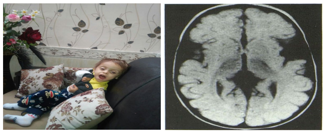
Figure 3: The case 3 after treatment. Brain MRI revealing severe fronto temporal atrophy