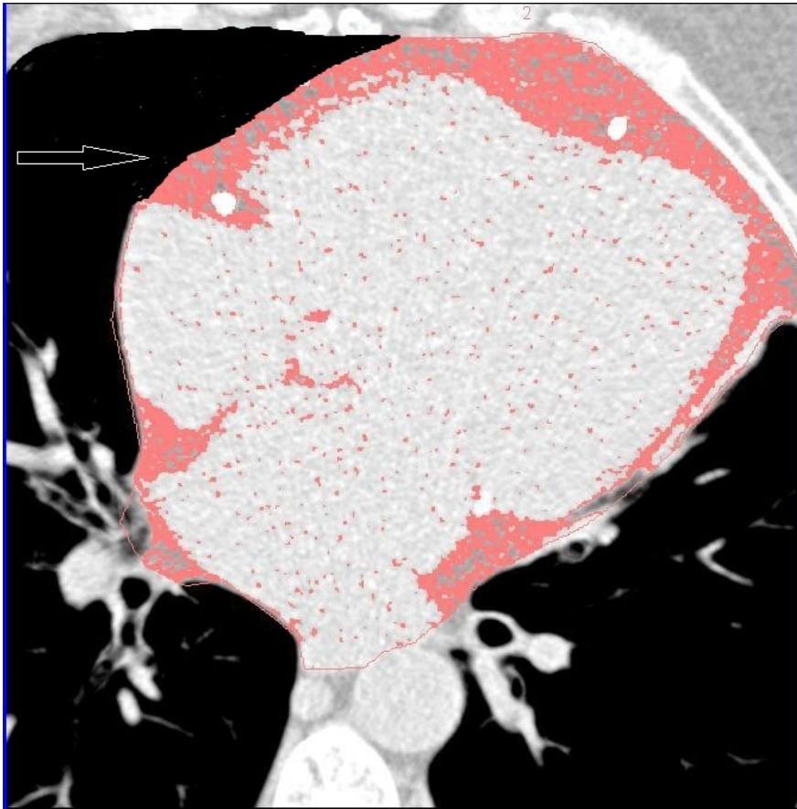
Figure 1: Tomographic measurement of epicardial adipose tissue volume. Pericardial fat was highlighted in orange after three-dimensional reconstruction

variability in the size of erythrocytes. Recent studies showed that RDW is also an inflammation marker and may predict POAF (10, 11).