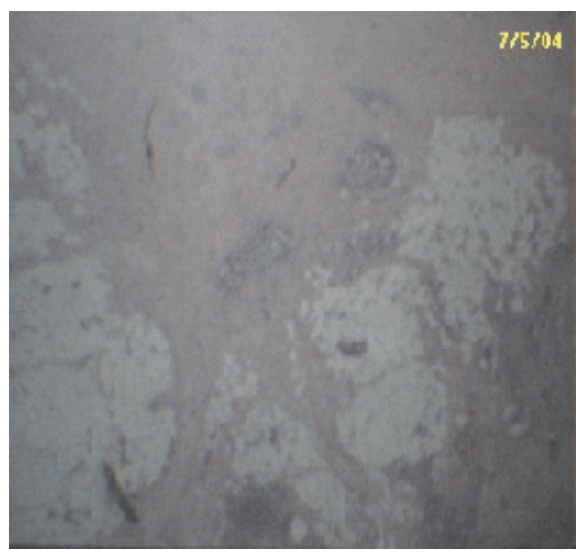
Figure 4. The pathology of second patient

Early operative intervention is necessary to avoid the increased morbidity and mortality associated with peritonitis. (21) During the laparotomic approach, if we do not find acute appendicitis and we find hemorrhagic liquid we should look for: ovarian torsion, bleeding