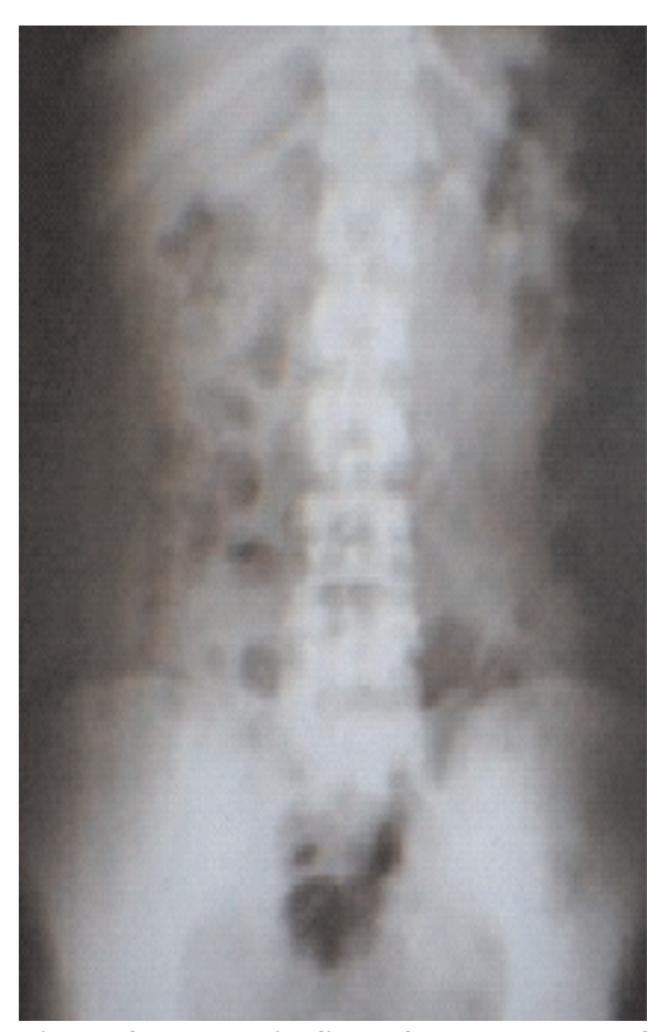
Figure 3. The plain film of the abdomen of second case

adherences. Symptoms correspond to a whole acute abdomen frequently confused with acute appendicitis, gynecologic disorders among others. (17) The patients present right and left lower quadrant pain, right upper quadrant pain, depending on the location of the lesion; nausea, vomiting and diarrhea, constipation, fever, anorexia; white blood cell count can be normal or slightly elevated a mass can be palpated at physical examination, rebound and acute appendicitis signs. The diagnosis can be supported by ultrasound which reveals a hiperecoic ovoid mass and more specifically by Computed Axial Tomography or Magnetic Resonance Image, that show more circumscribed lesions with interposed fat, hyper-attenuated areas generally localized in the right hemiabdomen; (4,7,15,18)laparoscopy can be diagnostic or curative. (5,19,20)