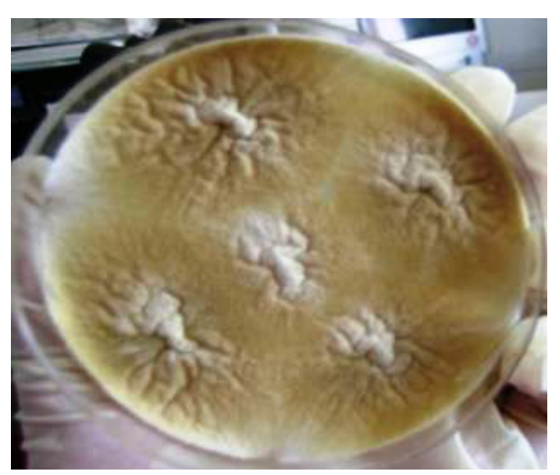
Figure 1. Colony morphology of P.variotii