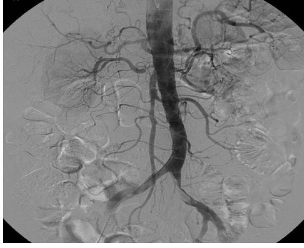
Figure 2. Irregularities in diameter and contour of lower extremity arteries seen in angiography. Severe stenosis in both renal arteries. Severe stenosis in left common iliac artery.

RAS is frequently diagnosed incidentally during investigation of peripheral vascular diseases (12). Atherosclerotic renal artery disease constitutes around 90% of all renal artery stenosis cases (Figure 2). Even in cases where hypertension is under control with medical treatment, failure of improvement in renal artery stenosis may lead to decrease in renal blood flow and ischemic injuries (9, 10). Therefore, revascularization of stenosis is recommended prior to development of renal function disorder (11). In several trials in literature, concurrent RAS was determined in 7.5-60% of symptomatic PAD cases, as shown by diagnostic angiography (13-25). Our results also indicate that RAS is a frequent finding in PAD patients; RAS was found in 228 of 1502 PAD patients (15.2%) which was determined as a significant rate. Variable results related to rate of RAS in above mentioned literature is due to varying degrees of stenosis and inclusion of patient groups with atheroma plague without a significant stenosis in several trials. In different trials based on stenosis >50 % and >60%, rate of RAS is 14-42%. Differences between these rates are due to selection of patient population and differences in standards. As indicated by results of these trials, incidental RAS is frequently seen in asymptomatic patients.