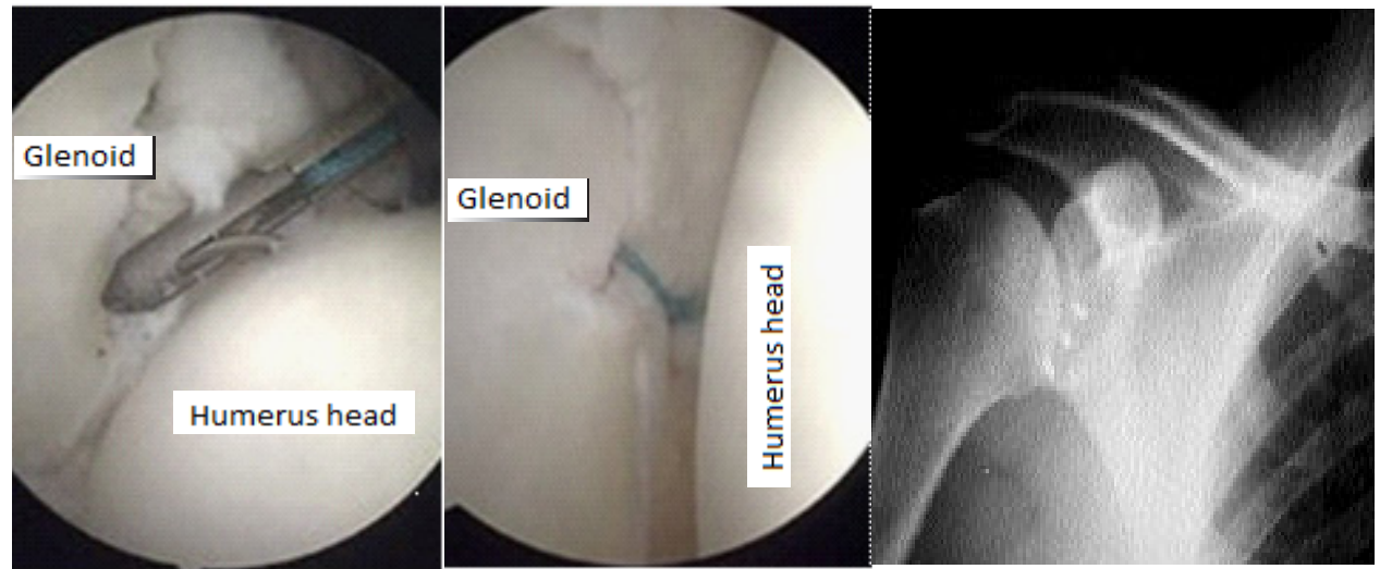
Figure 2. Arthroscopic view of Bankart repair with knotless anchor and postoperative radiography

gunsling only in the night and pendular and passive assistive exercises were begun. From the sixth to the ninth weeks range of motion increasing execises were begun with physical therapist surveillance. After ninth weeks active external rotation exercises were started. They were allowed all activities except contact and upper extremity sports at the 16. weeks. Upper extremity sports allowed after eighth months.