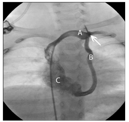
Figure 1. Injection in an innominate vein (arrow), connecting the left and right superior vena cava. Posterioranterior view of the injection showing the catheter in the innominate vein and contrast material in the left superior vena cava and draining into the right atrium. A; innominate vein, B; left superior vena cava, C; right atrium.