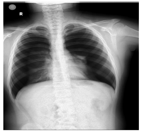
Figure 2. Posterior-anterior chest radiograph is showing bilateral pneumothorax.

of bilateral pneumothorax improvement.(5) (Figure 4). There are several mechanisms underlying pneumothorax. Firstly including tumor tissue rupture at the lung periphery, a check valve mechanism due to bronchiolar obstruction by tumor tissue, and secondly direct metastasis to a pulmonary cystic lesion (2). Treatment of pneumothorax is urgent if it is simulataneus and bilateral. Some reports have suggested that chemotherapy could increase the relative risk, due to necrotic changes, from 14%, and the period from chemotherapy initiation to pneumothorax onset ranged between first and seventh days(6). In our advice for the thoracic surgeons, firstly controlled of the primary tumor and also resec-