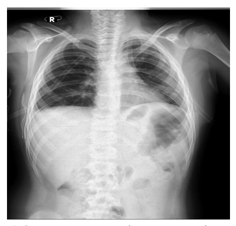
Figure 4 . Posterior-anterior chest x-ray is showing lung expansion after tube drainage.