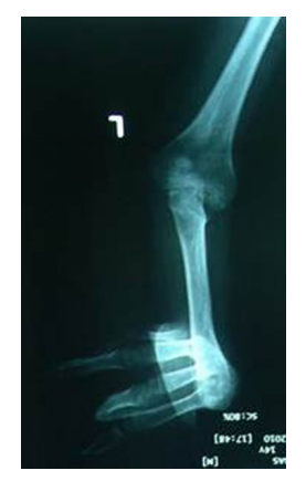
Figure 2. Preoperative x-ray of the patient.