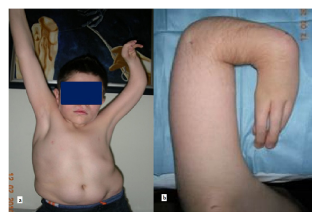
Figure 1. (a-b) Preoperative view of the patient (3).

We reviewed 8 cases of hands in 6 patients with congenital radial longitudinal deficiency deformities between 2002 and 2010 (Table 1). The patients were classified according to Bayne (3), and only patients with Bayne type III-IV deformities with indications for centralization were included in this study. The median patient age at the time of surgery was 2.75 years (range 2-14 years). Two patients were male, and 4 were female. All of the patients underwent centralization. Five patients had type IV deformities, and 3 had type III radial longitudinal deficiency deformities. A nonfunctioning thumb was associated with a radial longitudinal deficiency deformity in all hands. After centralization, we performed pollicization