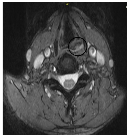
Figure 4. Axial T2-weighted MRI image showing paraesophageal edema (in circle).