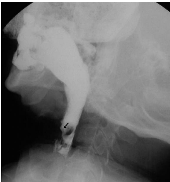
Figure 1. Barium swallow radiograph showing the compression on the anterior side of esophagus (black arrow).