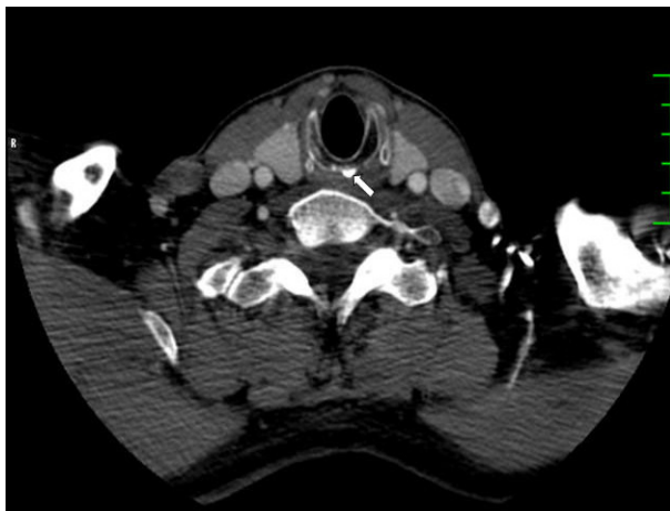
Figure 2. Axial CT scan showing osteophyte arising from the cricoid cartilage (white arrow).

Although cervical osteophytes are common in the aging population, dysphagia is rare (4). 3000 cervical spines with degenerative changes were examined and only six of them caused dysphagia (7). Postulated explanations of dysphagia caused by osteophytes include; mechanical