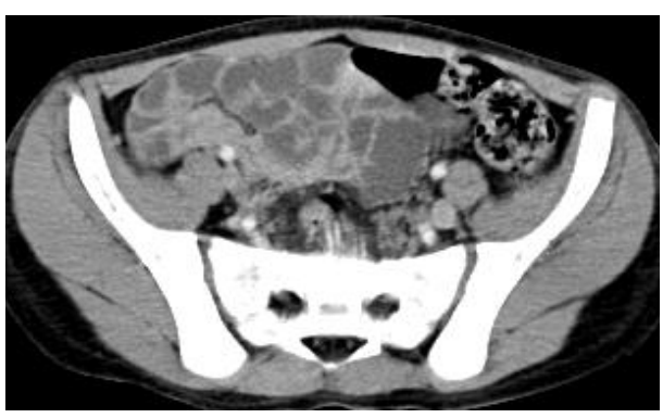
Figure 2. Computed tomography scan of abdomen showed wall thickness and dilatation of a 10 cm segment of terminal ileum and also free fluid in abdominal cavity. The measured wall thickness of the distal ileum was 8 mm

ment usually included nasogastric decompression, bowel rest, antibiotics and supplemental parenteral nutrition. In some conditions, such as perforation, surgery is needed. In this study we reported a 9-year-old girl with acute myelogenous leukemia (AML) who had enterocolitis that successfully managed by nonoperative approach. Also we present our radiological findings of this condition.