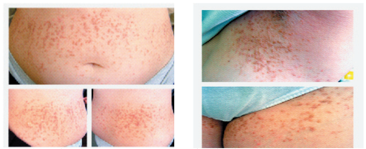
Figure 1. Multiple browny papules on the abdominal, inguinal, and axillary region