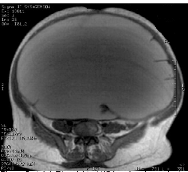
Figure 2. Axial T1 weighted MR imaging shows giant cyct in high signal intensity.