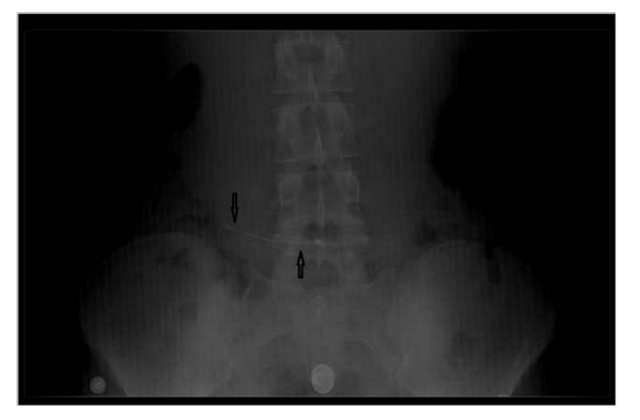
Figure 2. Two headscarf pins in the abdomen as revealed by the direct abdominal radiography.

Rigid bronchoscopy was performed on the patient. A headscarf pin was seen in the right main bronchus during rigid bronchoscopy and it was removed by a forceps. No complications occurred during the procedure. General surgery consultation was called for regarding the headscarf pins in the abdomen. The foreign bodies in the abdomen were followed up daily through direct abdominal graphs at a standing position by the suggestion of the general surgery department. The patient discharged both headscarf pins in the abdomen on the 2nd day of her hospitalization through defecation (Figure 3). The patient was discharged with full recovery on the 3rd day of her presentation to the emergency department.