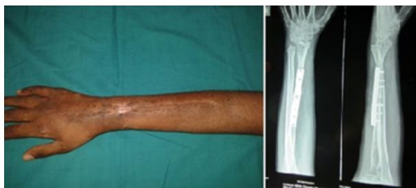
Figure 4. Follow-up clinical photograph and radiograph after four months

articular congruity is maintained. Fine needle aspiration cytology (FNAC) report was suggestive of giant cell tumor and as per Enneking classification and staging it was confirmed as aggressive benign tumor stage III (16). MRI was suggestive of lytic expansile destructive bony lesion involving distal end of radius with break in cortex with enhancing large soft tissue mass around 7.7×5.3 cm (Fig. 1). Considering the nature of growth and dominant hand, the case was treated by en-bloc resection and reconstruction arthroplasty using autogenous non-vascularized proximal fibular graft. In this procedure through dorsal approach around 18 cm “S” shaped incision starting from 3 cm distal to the wrist joint and 15 cm extending proximal to wrist was taken and radical en-bloc resection of tumor along with normal 4 cm of distal radius was excised along with the tumor as safe margin. The bone defect after excision of the tumor was 14 cm. Care was taken to preserve the neurovascular bundle while resecting the tumor mass from the surrounding soft tissue. Reconstruction of the bony defect was done using ipsilateral proximal fibular non-vascularised graft of 8 mm more length than actual required was taken to prevent carpo-fibular subluxation. The articular surface of the head of the fibula was placed over the scapho-lu-