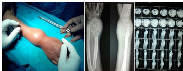
Figure 1. Pre-operative clinical photograph, radiograph and MRI coronal and sagittal section

first to describe the use of a free non vascular proximal fibular graft to replace the resected distal radius (9). Different success rates have been reported by different workers by using different approaches (10-15).