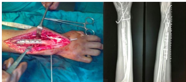
Figure 2. Intra-operative photograph showing autogenous fibular graft fixed with K-wires, DCP with bone graft and immediate post-operative radiograph

A 23- year old female presented with swelling and pain in Rt. wrist for the last one and half year. The sudden aggressive increase in swelling and pain was observed since four months. On examination, swelling over the dorsal aspect of distal end of radius around 5 by 10 cm in size was observed. The skin over the swelling was found to be shiny, tense, with raised local temperature and tenderness of grade III with ill-defined margins. The range of movements of wrist joint and hand were grossly restricted with intact neurovascular status. Anteroposterior and lateral radiograph of the Rt. wrist showed an expansile lytic lesion in the subarticular position of the distal radius with break in cortex but