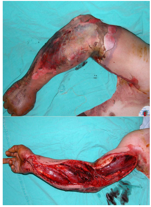
Figure 3. Upper: Electric current burn, Below: Armforearm following fasciotomy; edema and burns in the muscles attract attention.

A: Preferred incision figures which were used in forearm fasciotomy procedures and radial and ulnar pedicule flaps that can be used to close up the wrist B: Incisions used to free the dorsal, volar, and adductor compartment of the thumb in the hand C: Incisions with non-dominant sides in digit fasciotomies. The thumb was opened up from the radial side while the other fingers were opened up from the ulnar side.