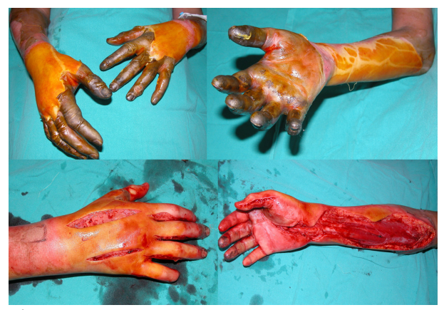
Figure 2. Upper left and right; fire burn of both hands and the forearm. Below left; the hand dorsal. Below right; forearm following fasciotomy.

The first eight hours in the evaluation of compartment syndrome is called the "early phase" while the time that exceeds eight hours is called the "late phase" (2). The