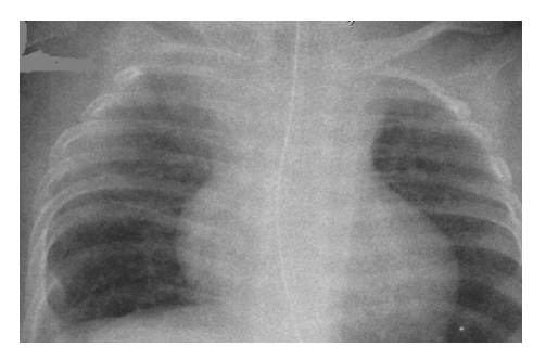
Figure 1. Pre MH therapy

This is the first study assessing the effect of MH in arterial oxygenation of the upper lung lobe collapsed paediatric patients after cardiac surgery. The findings from this study are in line with the previous studies suggesting that MH is beneficial for patients after surgery. A randomized controlled trial done before concluded improvement of PaO<sub>2</sub>, static compliance and reduced the duration of mechanical ventilator, in patients after myocardial revascularization (9). One more randomized controlled trial confirmed MH improved oxygenation after surgery (12). Plugging of airway secretions may lead to airway obstructions, thereby causing gas resorption distal to the obstructions, leads to lobar collapse in mechanically ventilated patients. Clearance of airway secretion by MH have been demonstrated before. Higher expiratory than inspiratory flows produced by MH clears the airway secretions in intubated and mechanically ventilated patients. Our data suggest that MH could contribute to the recovery of collapsed lung areas after cardiac surgery in paediatric patients. MH does this by administering increased tidal volumes, inspiratory pause which creates transpulmonary pressures to overcome alveolar collapses (28). Studies done in the past showed that airway pressures of 40 cmH2O maintained for eight to nine seconds is needed to reopening the collapsed lung tissue completely (29). As MH is not capable of providing such pressures for lon-