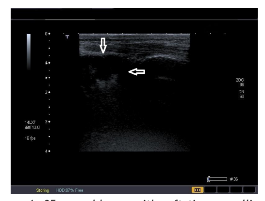
Figure 1. 35-year-old man with soft tissue swelling of the wrist, ultrasound image shows the anechoic lesion (arrows) of the wrist indicated that it is cystic mass. The pathological result is ganglion cyst.