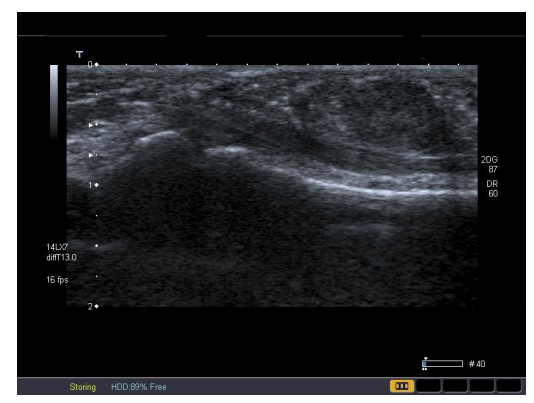
Figure 2. 47-year-old woman with soft tissue swelling and mild pain in third finger flexor aspect. A homogenous, hypoechoic, well-delineated solid mass adjacent to the tendons was seen in ultrasound. The pathological result was giant cell tumor of the tendon sheath.

reliable identification of a variety of traumatic lesions affecting tendons, retinacula and annular pulleys, ligaments, vessels, and nerves (2, 3). Hand and wrist masses may be secondary to tumors, infection, inflammation, degeneration, or trauma (1). In patients with soft tissue masses in the hand and wrist area, ultrasonography is often able to assess the presence of a space-occupying