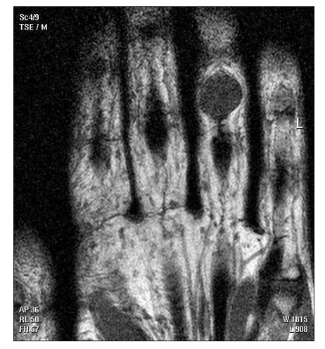
Figure 4. 33-year-old woman with soft tissue swelling in fourth finger flexor aspect. In non-contrast enhanced T1 weighted magnetic resonance image there is well-defined, hypointense lesion adjacent to the tendon.