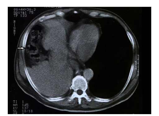
Figure 1 . Interposition of bowel