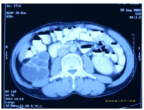
Figure 1. Lobulated cystic mass including septations and peripheral calcifications in CT in right kidney.

gen and C-reactive protein levels. Abdominal ultrasound showed a collecting tube enlargement in the upper pole of the right kidney. CT scan showed a lobulated cystic mass including septations and peripheral calcifications (Figure 1). This lobulated cystic mass spreaded to renal pelvis. The patient underwent transperitoneal radical nephrectomy on the right side through a lombotomic access with a preoperative diagnosis of renal tumor. Histopathologic examination revealed collecting duct carcinoma. The patient was called for control after one month. Control CT scan was performed and showed normal findings. But MRI showed a heterogenous solid