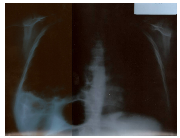
Figure 1. Unexplained air-fluid levels in chest radiography.