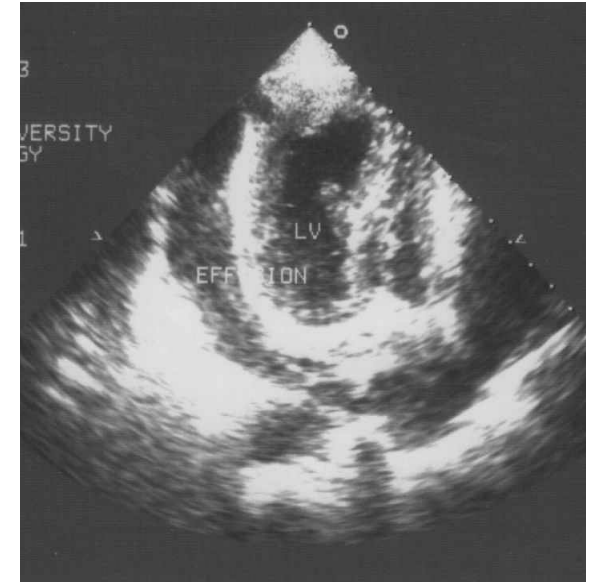
Figure 1. Preoperative echocardiograph in short axis examination shows myocardium was transmurally detached (arrow) at a diameter of 0.5 cm in the apico-lateral region.

Blood pressure returned to normal (120/70 mmHg) within 2 hours after the procedure and inotropic supportive treatment was tapered and stopped. Echocardiographic examination performed on the second day of AMI on the asymptomatic patient revealed that myocardium was transmurally detached in diameter of 0.5 cm in the apico-lateral region. There was a thrombosed appearance with fibrin structure in the epicardial part of the myocardium in the relevant region (Figure-1). Hypokinesia of the wall movements in the lateral and anterior basal walls was detected. Left ventricular ejection fraction was 50%. The case was recognized as a free wall rupture. Laboratory examination revealed a normal hemogram and routine biochemical parameters except for a typical increase in troponin CK-MB compatible with AMI.